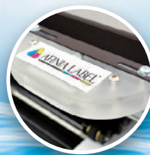
New optical sensor