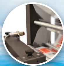
Laminating (DLF-220L only)