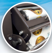
Adjustable web clutch