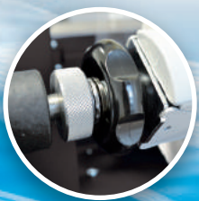
Core holder clutch